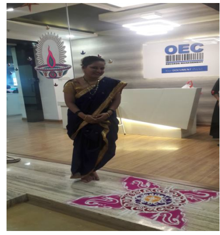
Diwali Celebration in Head Office